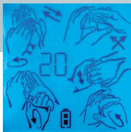
Compass™ Handwash LCD screen

The Compass™ dispenser provides reinforced training instructions for proper handwashing procedures. The LCD screen on each dispenser guides you through the 6-step process for washing hands as recommended by the Centers for Disease Control.