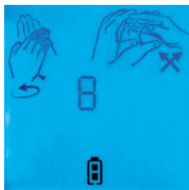
Compass™ Sanitize LCD screen